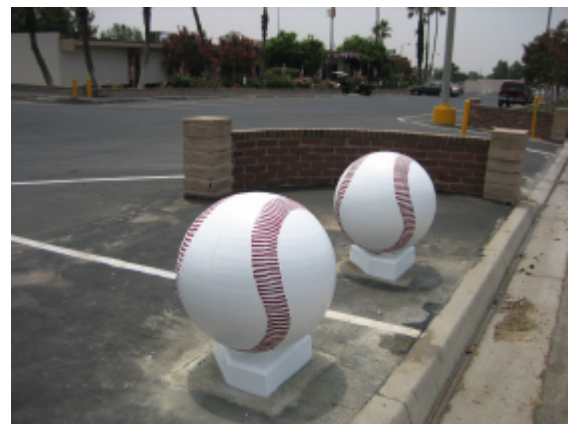
30” Baseball Security